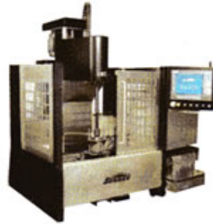
High performance vertical honing

Phone: 281-391-8989 ~ Fax: 281-391-8057 ~ Email 3D Honing